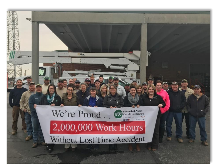
SVEC employees from the Winchester District celebrate the cooperatives impressive safety milestone.

For the first time in the more than 80-year history of Shenandoah Valley Electric Cooperative , employees have worked a combined 2 million hours without a lost-time accident . The cooperative celebrated the occasion recently.