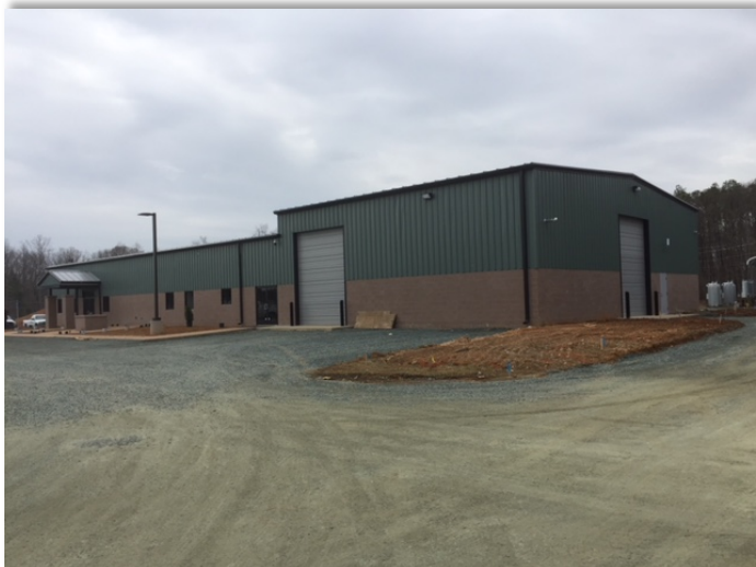
The Association’s new training center is complete, and landscaping and paving will be done soon.

In addition to the three classrooms, the training center also has a large garage bay that will provide an ideal space for equipment displays and training during inclement weather. There is also a reception area with three offices and a small conference room ; and a large catering kitchen and adjoining break room .