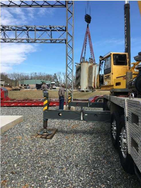
CSE crane service unloading and setting the 32,000-pound transformer on its pad in Palmyra.

Thanks to the abiding generosity of VMD member systems, the Association’s new Training Center in Palmyra will soon have its own training substation .