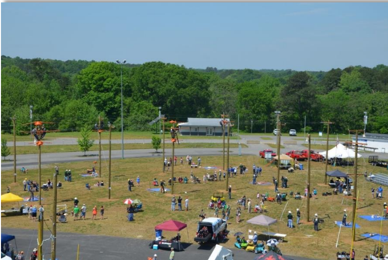
A view of the event field at last year's Gaff-n-Go Rodeo.

Listen, and soon you'll hear the familiar sounds of spring: the chirp of a bird, the crack of a baseball bat and the clang of an electric utility line worker strapping on gear for the annual Gaff-n-Go Lineman's Rodeo .