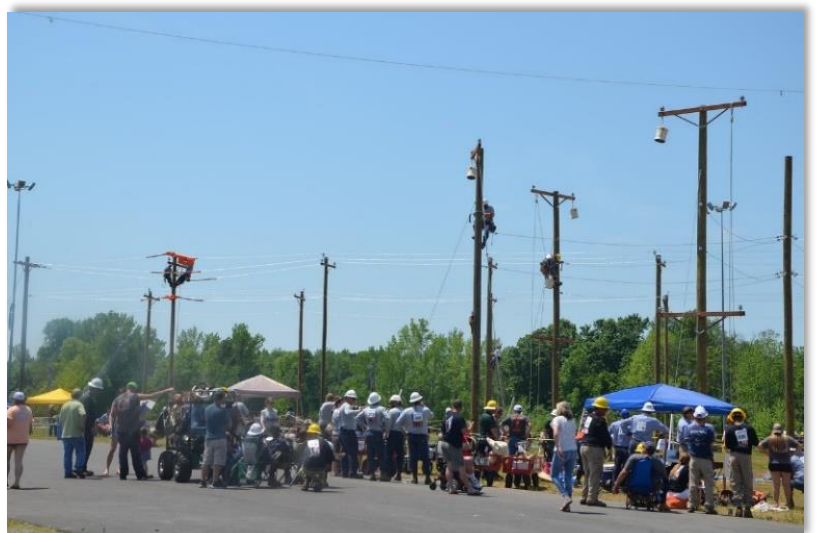
A crowd watches a climbing event at last year's Rodeo at Meadow Event Park.