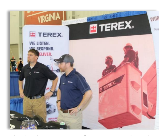
Thanks always to TEREX for sponsoring the rodeo in partnership with NESCO Specialty Rentals!