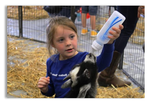
Feeding time: Somebody's hungry and that means a bottle from one of the littlest NOVEC team members to one of the littlest critters at the petting zoo.