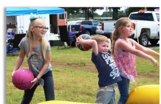
Heave ho! In addition to proudly watching their dads compete in the challenging rodeo events, the large number of future line workers took part in kids' activities such as ball tosses and moon bounces.