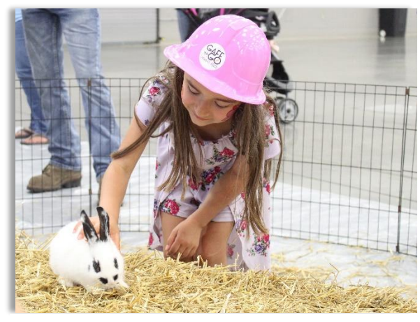
Wascally Wabbit: A young rodeo fan enjoys the petting zoo on Saturday, May 11.