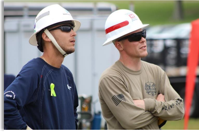
This year's rodeo included two U.S. Army "Prime Power" teams from the 249th Engineer Battalion at Fort Belvoir, Va.