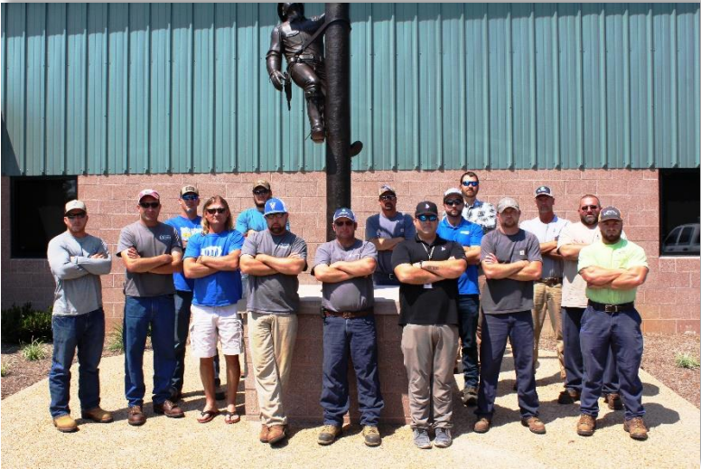
Bolivia-bound lineworkers pose outside the VMD Electric Cooperative Training Center in Palmyra.

Rappahannock Electric Cooperative hosted its second Telephone Town Hall of the year on Tuesday, Aug. 27 . REC invited a random sample of 50,000 member-owners to participate in the call. Nearly 5,000 members accepted the call to participate.