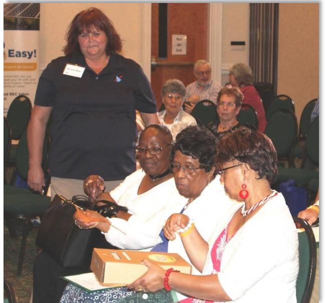
Member-owners cast their ballots for directors at the Rappahannock Electric Cooperative annual meeting.