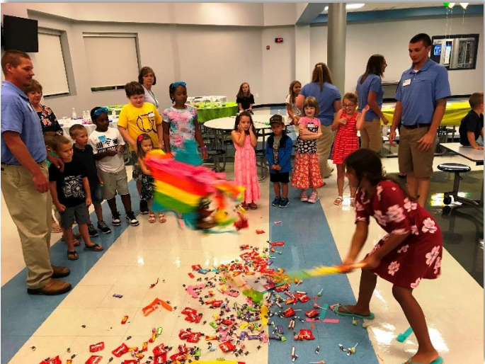
A candy-filled piñata came crashing down after numerous blows as part of Kids' Corner at the Community Electric Cooperative annual meeting.