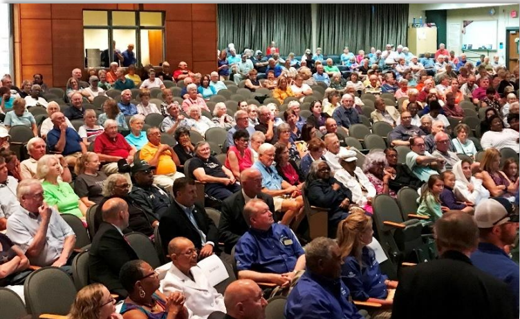
A large and happy crowd of members and guests enjoyed good food, fellowship and co-op business at NNEC's Annual Meeting on August 1 at Northumberland High School.