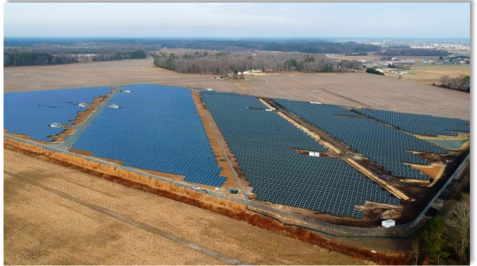
New solar panel arrays have come online at Delaware Electric Cooperative's Bruce A. Henry Solar Farm in Sussex County.