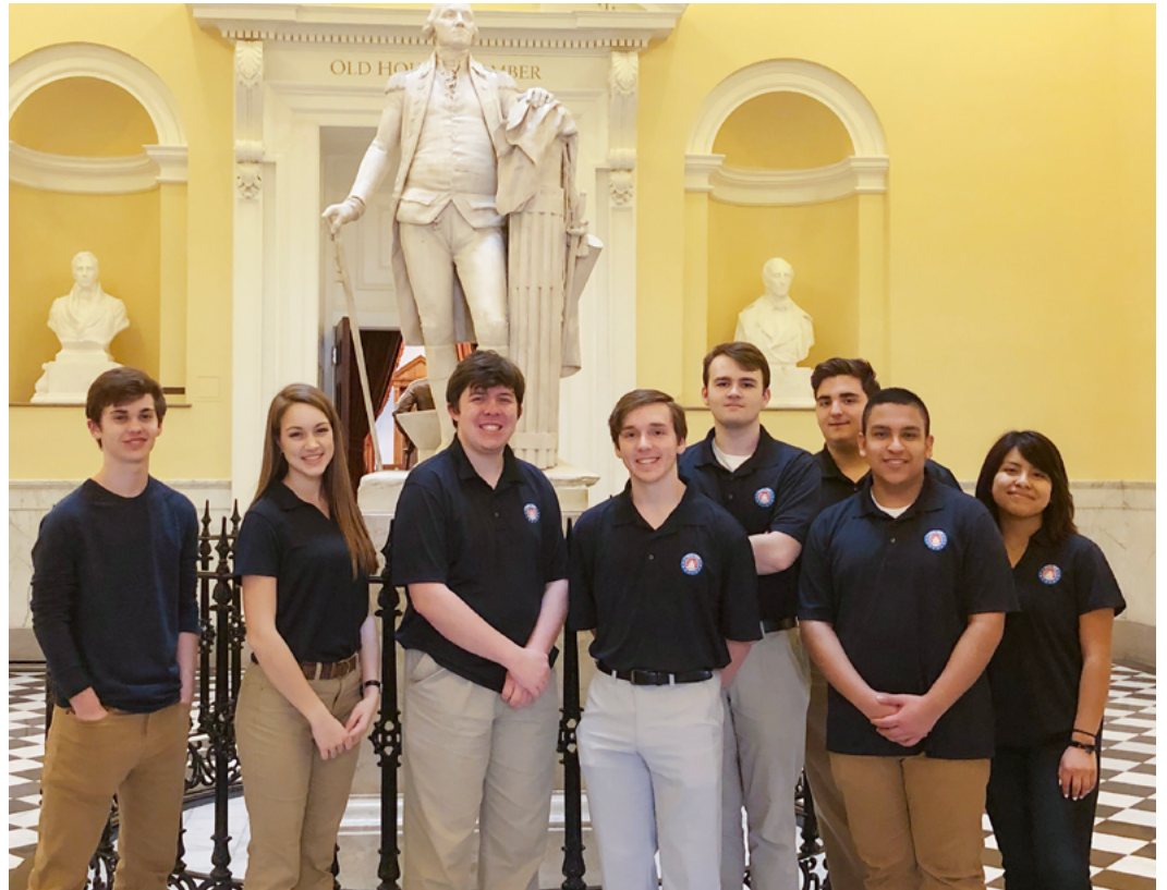
REC’s Youth Tour contingent poses in front of the statue of George Washington in the rotunda of the Virginia State Capitol.

The students were able to learn about the legislative process and current issues being addressed by each delegate.