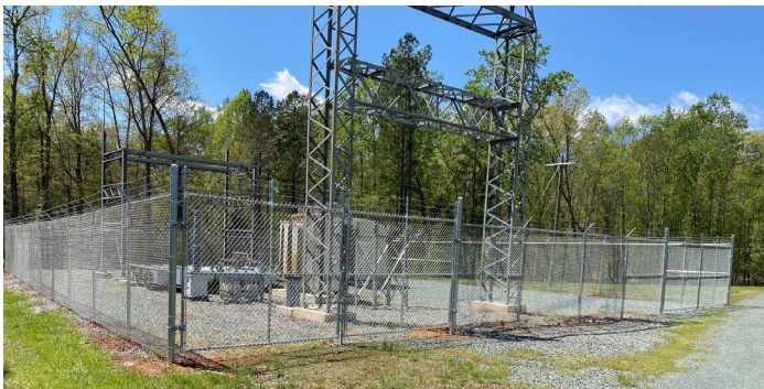
Fencing was recently installed around the practice substation that adjoins the Association’s Training Center in Palmyra.

Substation fences protect the enclosed equipment from the public and from most animals. By limiting access to the substation, electric utilities maintain tighter control over their electric system, improve reliability, and maintain safety for the public and their own employees.