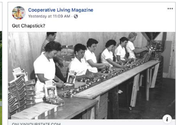
Chapstick Was Invented In The Charming Mountain Town Of Lynchburg, Virginia In The 1800s