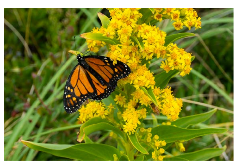
USFWS offers a final conservation agreement for the monarch butterfly that co-ops can enroll in to attain regulatory certainty prior to a listing decision about the species in December.

Co-ops may enroll in the CCAA until the monarch is listed but early enrollments through the end of June will be factored into the agency's listing decision. Read the full story by Cathy Cash on Cooperative.com at tinyurl.com/ydefq4g8